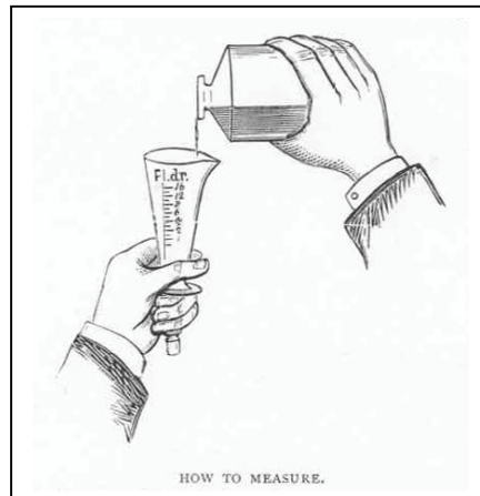
From Art of Dispensing , 1926