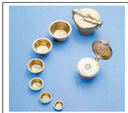
Nesting Weights Museum of the RPSGB

The only capacity measure in the Apothecary system was the liquid grain, the volume of one grain of water, which was introduced in 1885 as a "metric equivalent" but little used.