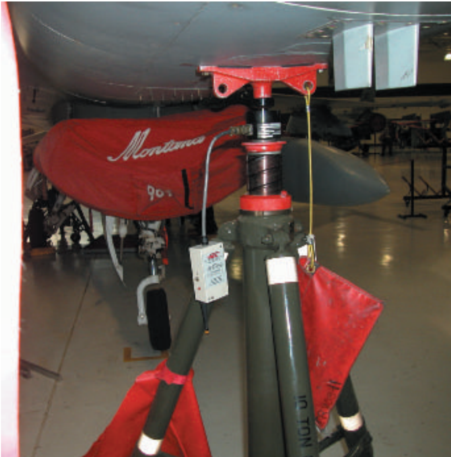
Wireless load cell, top of jack configuration. GEC Scales.

that the load cell will perform accurately longer requiring less frequent calibrations. It is also worth noting that our older-generation platform scales can be up to four inches high, and weigh up to 140lbs each, whereas our new equipment is less than two inches high and weighs roughly 70lbs per platform."