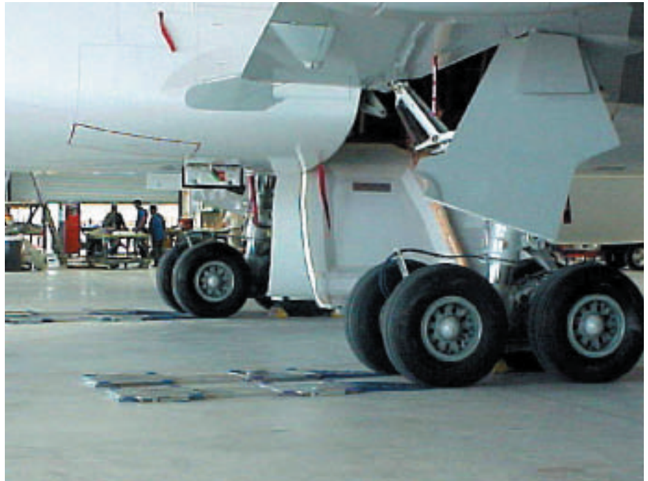
Platform scales from General Electrodynamics Corporation (GEC). More expensive to purchase, but much simpler to use than conventional top-of-jack load cells.

There are two principle methods to weighing an aircraft: the 'platform scale' method — which is fast becoming the de-facto standard — and the 'load cell' technique. Each approach has its advantages and disadvantages depending on the specific application in hand. Aircraft Technology looks at both the technology evolution and operation of aircraft weighing equipment.